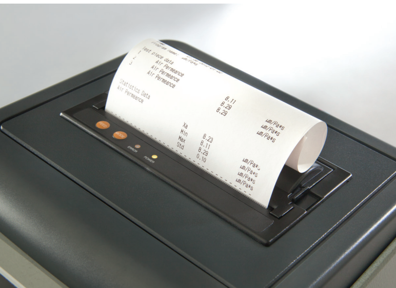
Built-in thermo printer.